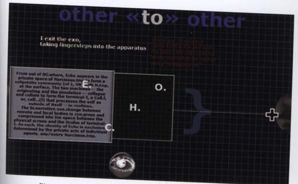
Figure 6. Screen shot, Lexia to Perplexia

This doubling effect is carried out in part through the sophisticated play between Echo and Narcissus that dominates the work's first section and appears intermittently throughout. Icons of eyes and the letters E. C. H. O. splash across the